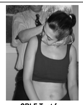
CRLF Test for evaluating a LEFT first rib dysfunction

The cervical rotation lateral flexion (CRLF) test has been shown to have good reliability and validity for detecting individuals with TOS based on the hypothesis that the test can detect a restricted first rib (Gilbert et al 2004, Lindgren et al 1992). With the patient seated, the examiner