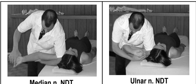
Median n. NDT

Median nerve and ulnar nerve neurodynamic testing (NDT) have been shown to be reliable and valid for identifying cervical radiculopathies and excellent for screening for sensitization of the neural tissue in the cervical spine, brachial plexus and upper limb (Wainner et al 2003). NDT tests are not specific for detecting neural sensitization in one area, for instance, a positive ulnar nerve NDT may indicate nerve sensitization or compression at the nerve root in the cervical spine, the thoracic outlet, the ulnar groove at the elbow, or tunnel of Guyon at the wrist. Although there are no studies to date supporting the validity of NDT specifically for TOS, it may nevertheless be an excellent